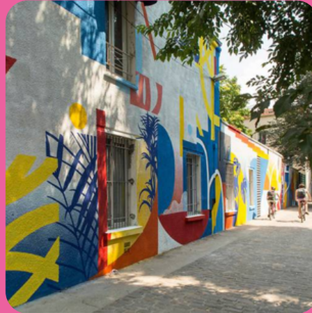
Musée d'art et d'histoire Paul Eluard (Saint-Denis)